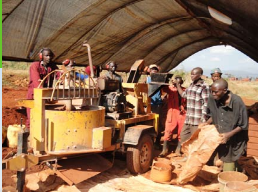
Workers try their hand on the state of the art hydraform machine.

The project will run until 2012. At the end of the project, 120