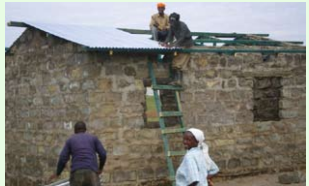
A jovial house beneficiary at HFHK's Internally Displaced Housing Project in Maai Mahiu

Life in the tented camp was not easy. We cooked in recycled tins as we had lost all our household goods, slept huddled together in the tent and depended on well-wishers for food supplies. With fate bringing us together, we had no choice but to unite. Unite and find a lasting solution. And so we did. We pooled the resettlement money given to us by the government and bought a piece of land in Maai Mahiu area along Maai Mahiu-Naivasha road. I lived in a tent for two years with the hope that God will respond to our plight.