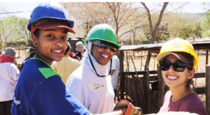
It is all smiles for students of Dhahran High School during their Global Build visit in Eldama Ravine.

The first three months of this year have been quite eventful for Habitat for Humanity Kenya. A record 10 global village teams joined Kenya's rural low income families with one mission in mind-to help them build decent and durable homes.