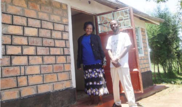
The joy of owning a house

sounds of beautiful Atlanta, was the opportunity to meet with some of you and the conversations that we had, comparing the building programs in the US with our own building programs in Kenya. And for those of you who tithe to Kenya, thank you very much for your support that has enabled us house 5000 families in houses that they are proud of and which give them hope and dignity.